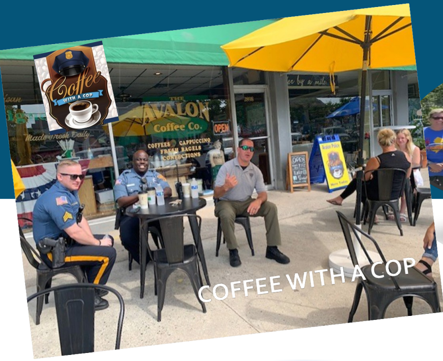
COFFEE WITH A COP