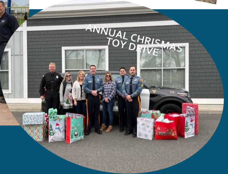
ANNUAL CHRISTMAS TOY DRIVE